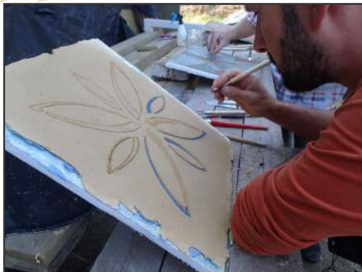
Sgraffito – this is it!