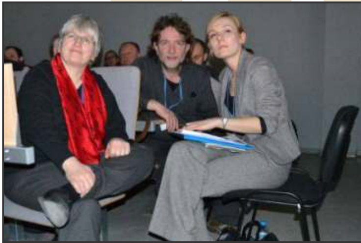
Conference in Poznań (Poland), 27.02.2014.

In January and February 2014 we organised dissemination of our project. Several meetings and taking part in educational and building fairs. It was an opportunity to pass to the Polish market the information: “The clay plasters are here – you can use them – and we're the place where you can learn about it”.