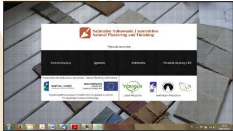
Screenshot from the DVD

From June to September 2013 we did several test trainings for unemployed people from all over Poland. Very fresh trainers (with a bit more experienced architects and plasterers) were training unemployed people in different units. They succeeded – nine of twenty-nine beneficiaries found a job in the field of clay plasters! During October and November 2013 we finished the final form of the products of the project: paper and DVD