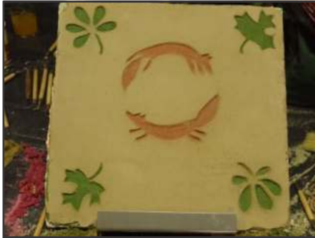
Sgraffito made by the future trainer

From June to September 2013 we did several test trainings for unemployed people from all over Poland. Very fresh trainers (with a bit more experienced architects and plasterers) were training unemployed people in different units. They succeeded – nine of twenty-nine beneficiaries found a job in the field of clay plasters! During October and November 2013 we finished the final form of the products of the project: paper and DVD