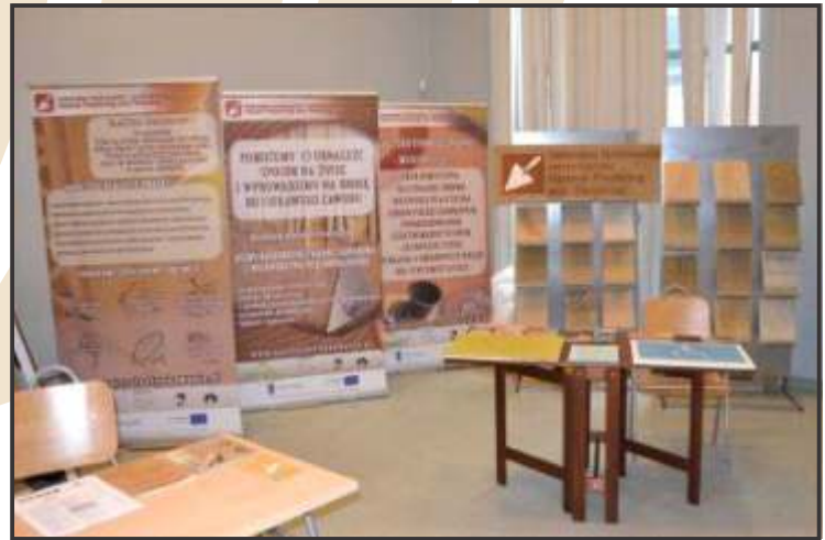
Stands of the project.

In the future we will continue to train new trainers and unemployed people all over Poland. In addition, Venum takes part in different international initiatives concerning earth building.